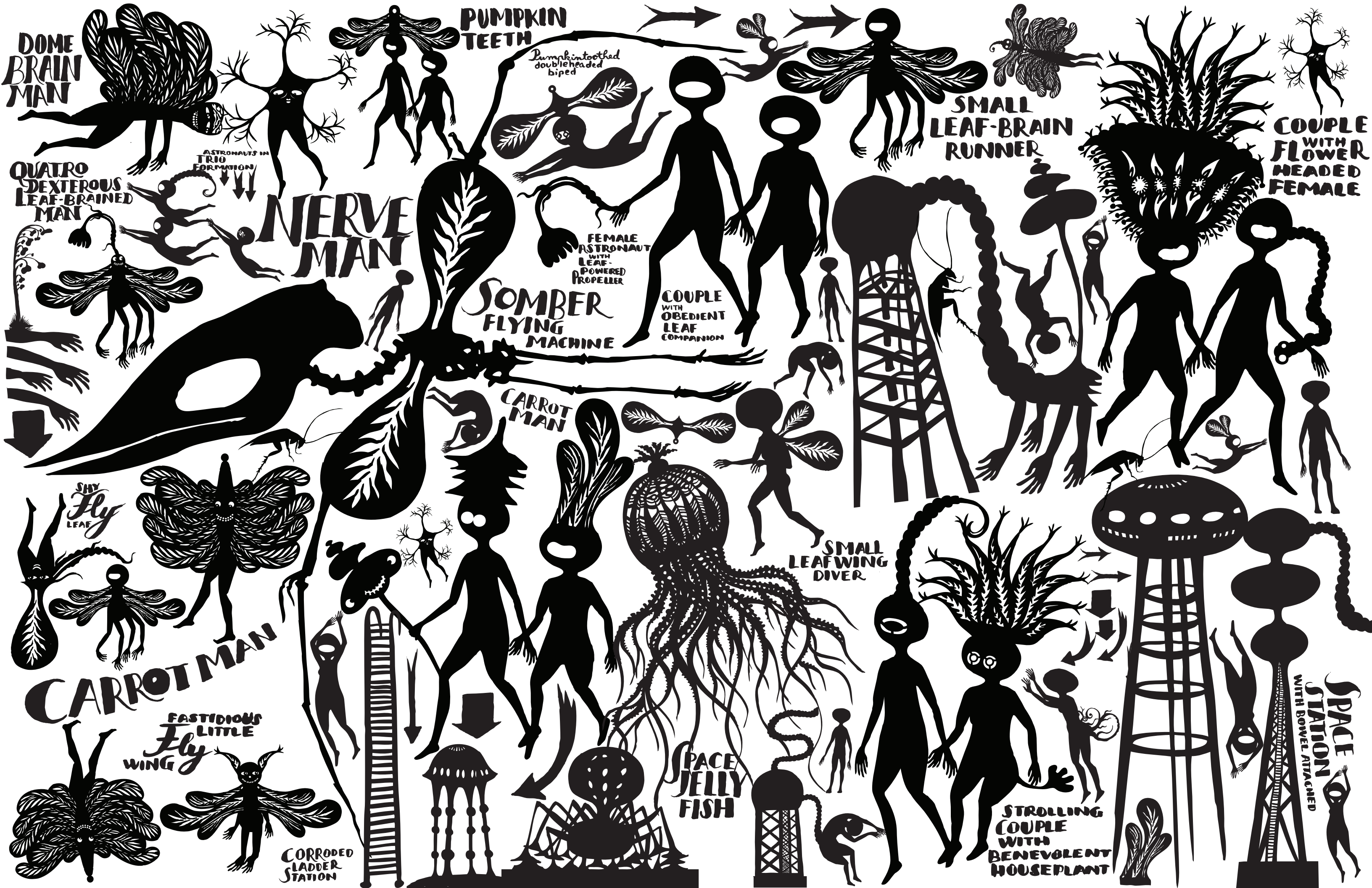
DOME BRAIN MAN